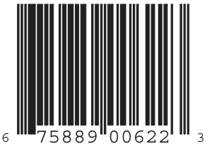
RA62c Headphone Amp

ROLLS ROLLS CORPORATION SALT LAKE CITY, UTAH 6/11